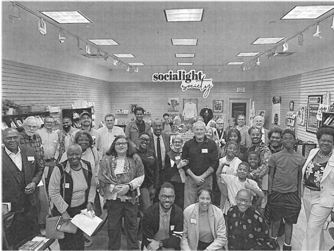
Justice league of GLM Community Book Read- 2022