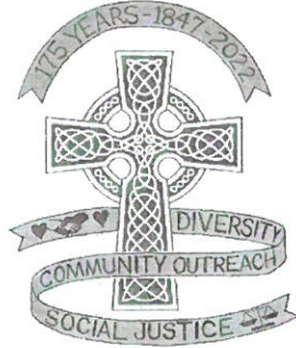
Lansing First Presbyterian Church

December 17, 2022 marked the 175 th anniversary of the founding of our church, The First Presbyterian Church of Lansing (1847-2022).